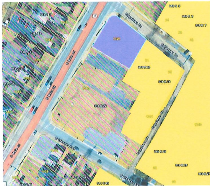
Comp Plan – Mixed Use