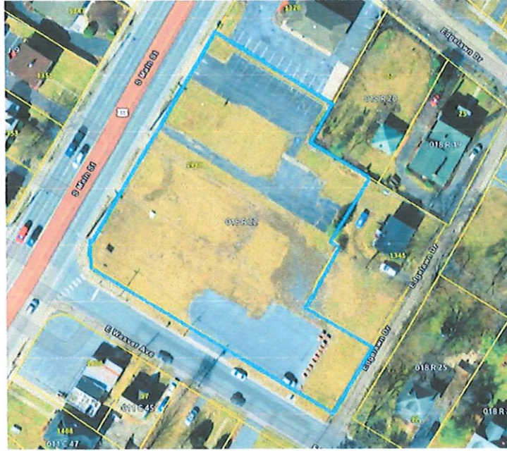
Current Zoning – R5C