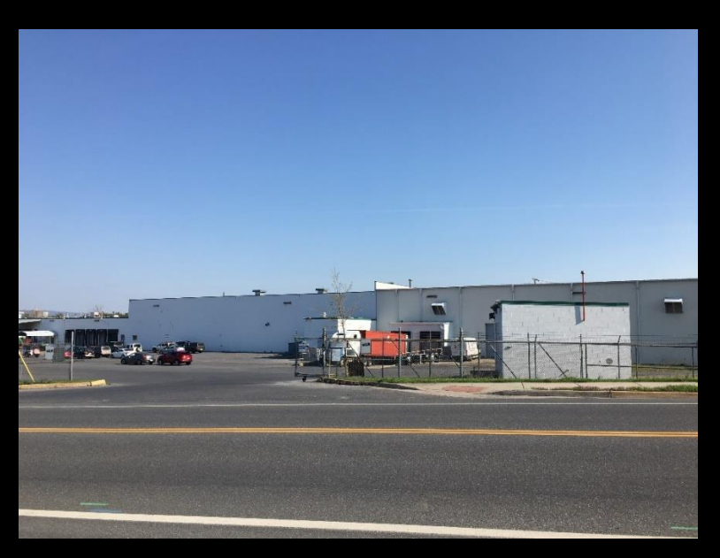
North: Industrial Operations