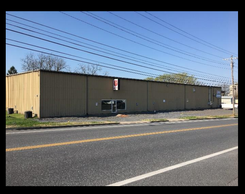
West: Industrial Operations