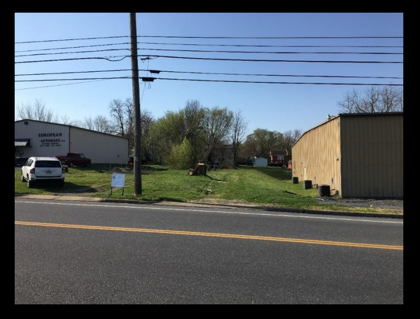
East: Vacant Parcel