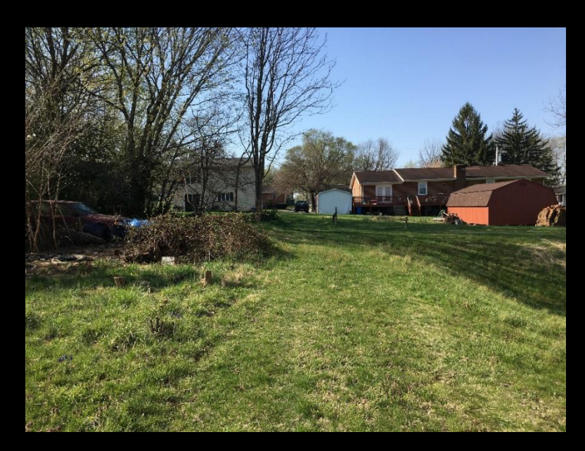
South: Single-family dwellings