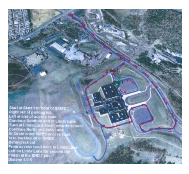
Linda Lane course: 150+ runners/walkers (Event organizers will need permission from Smithland Elementary/Skyline Middle if school parking lots and facilities are needed.)

EMU course*: Must be approved through Eastern Mennonite University before checking this box. Please include evidence of university approval in the form of an email exchange or MOU.