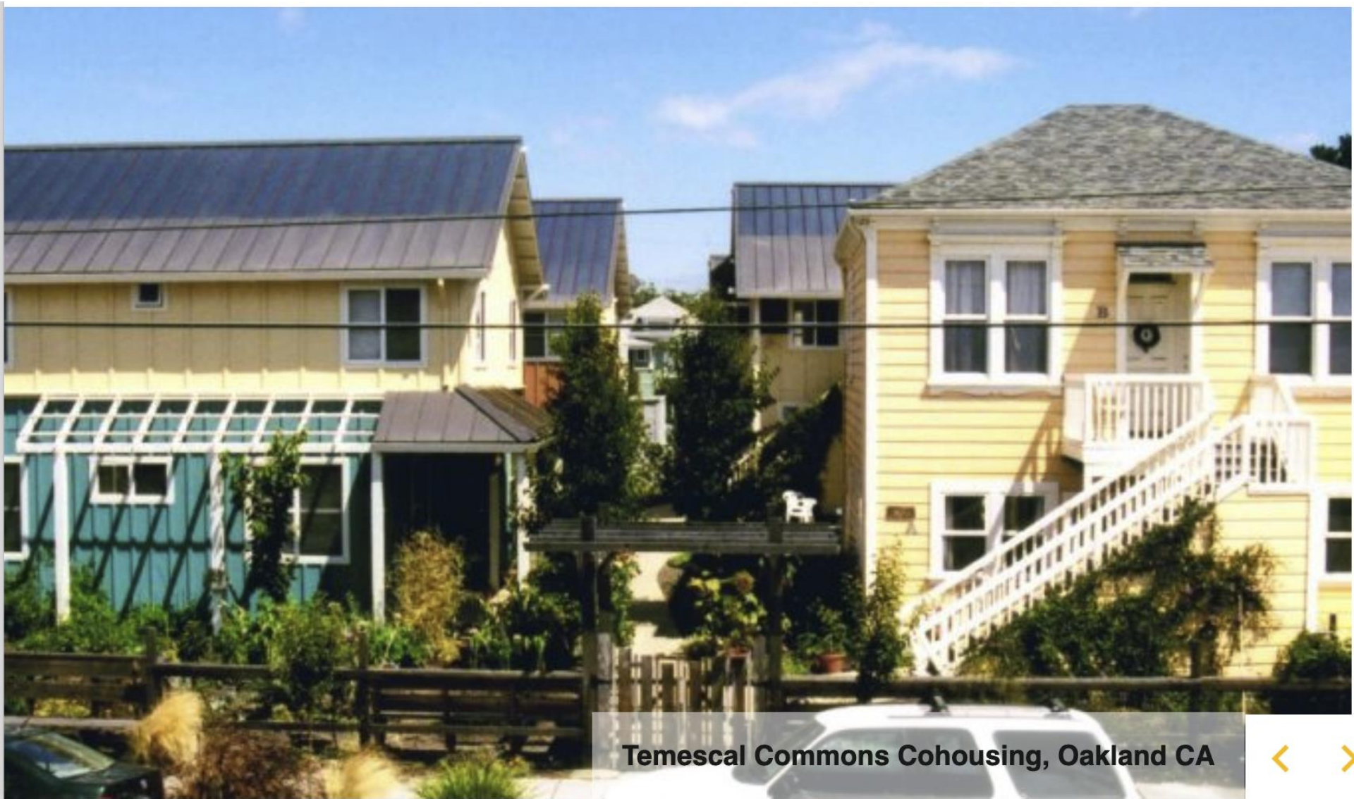
Temescal Commons Cohousing, Oakland CA