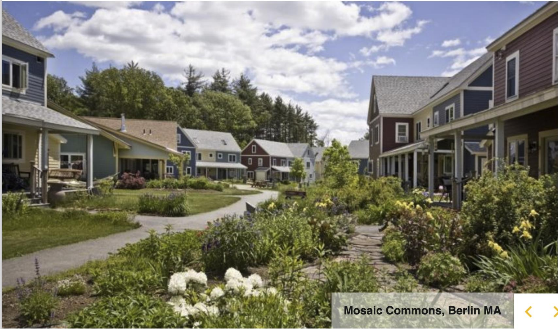
Mosaic Commons, Berlin MA