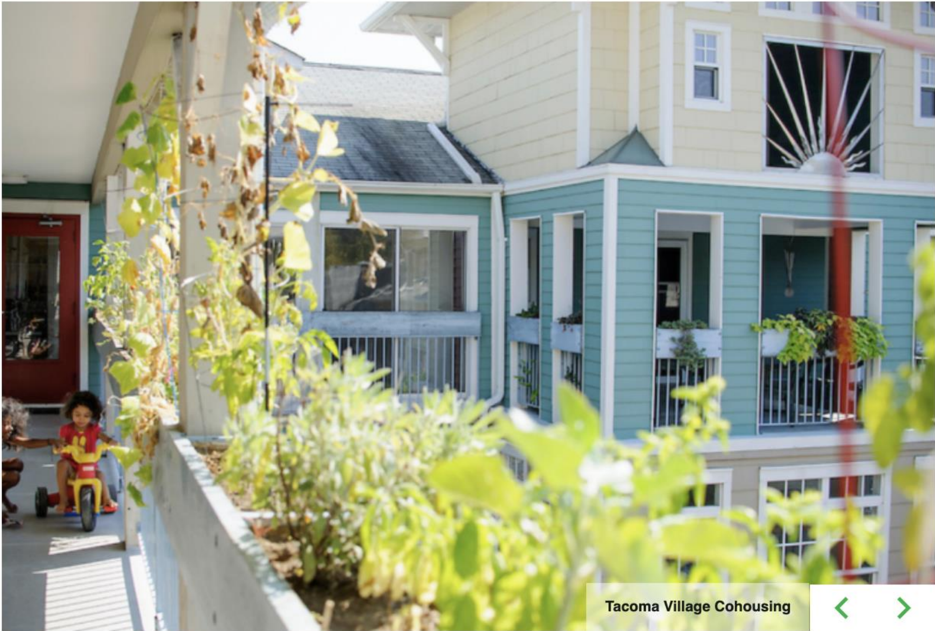
Tacoma Village Cohousing