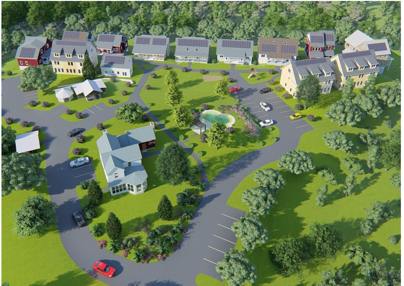
Emerson Commons, Crozet VA