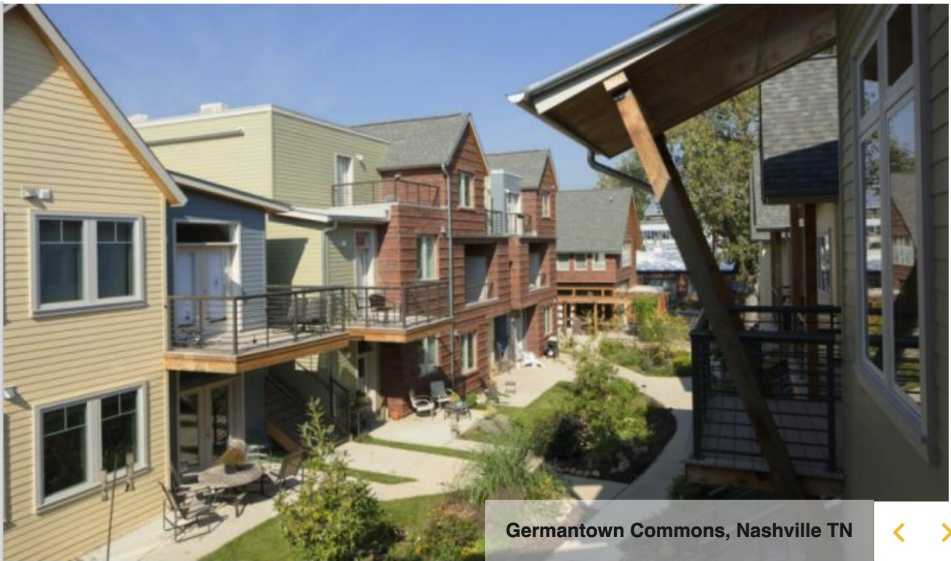
Germantown Commons, Nashville TN