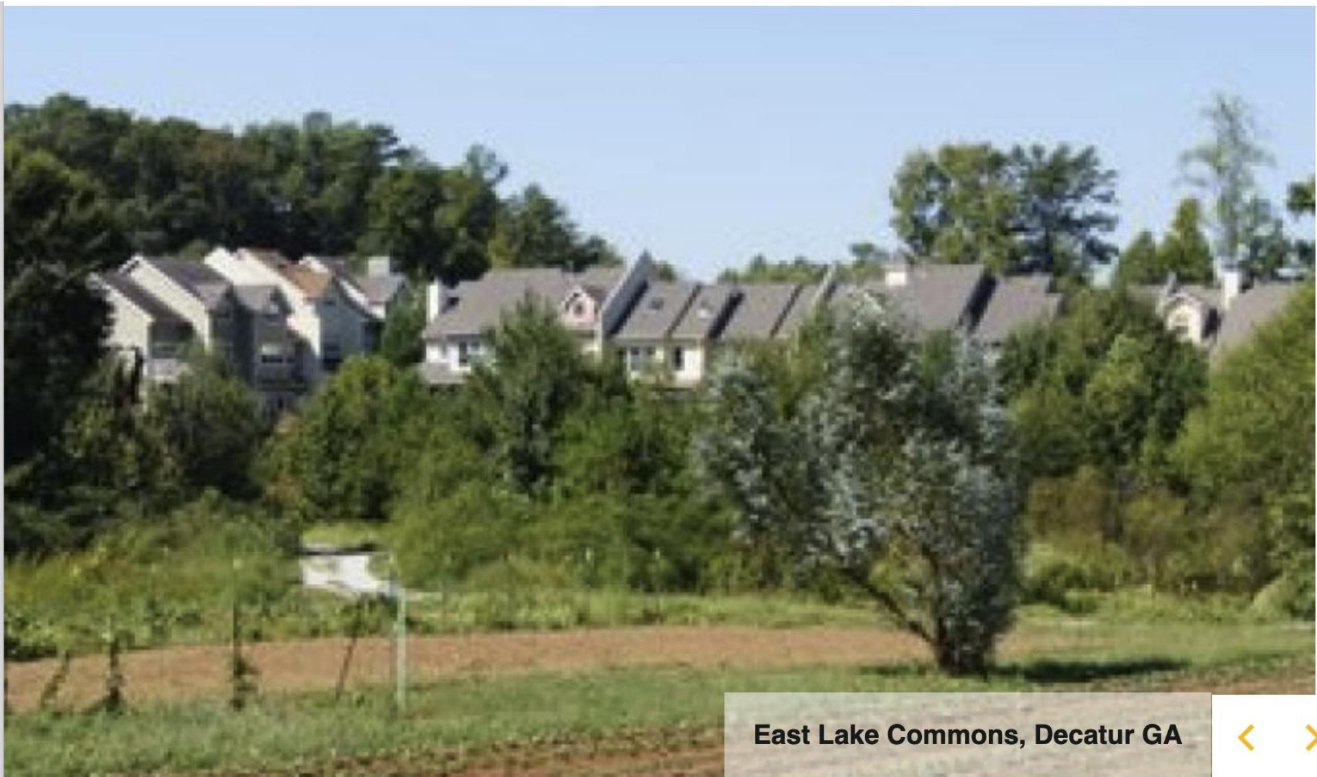
East Lake Commons, Decatur GA