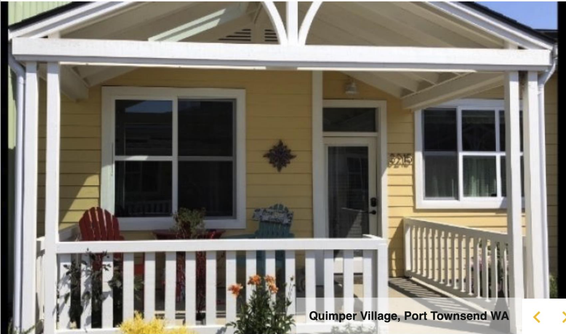
Quimper Village, Port Townsend WA