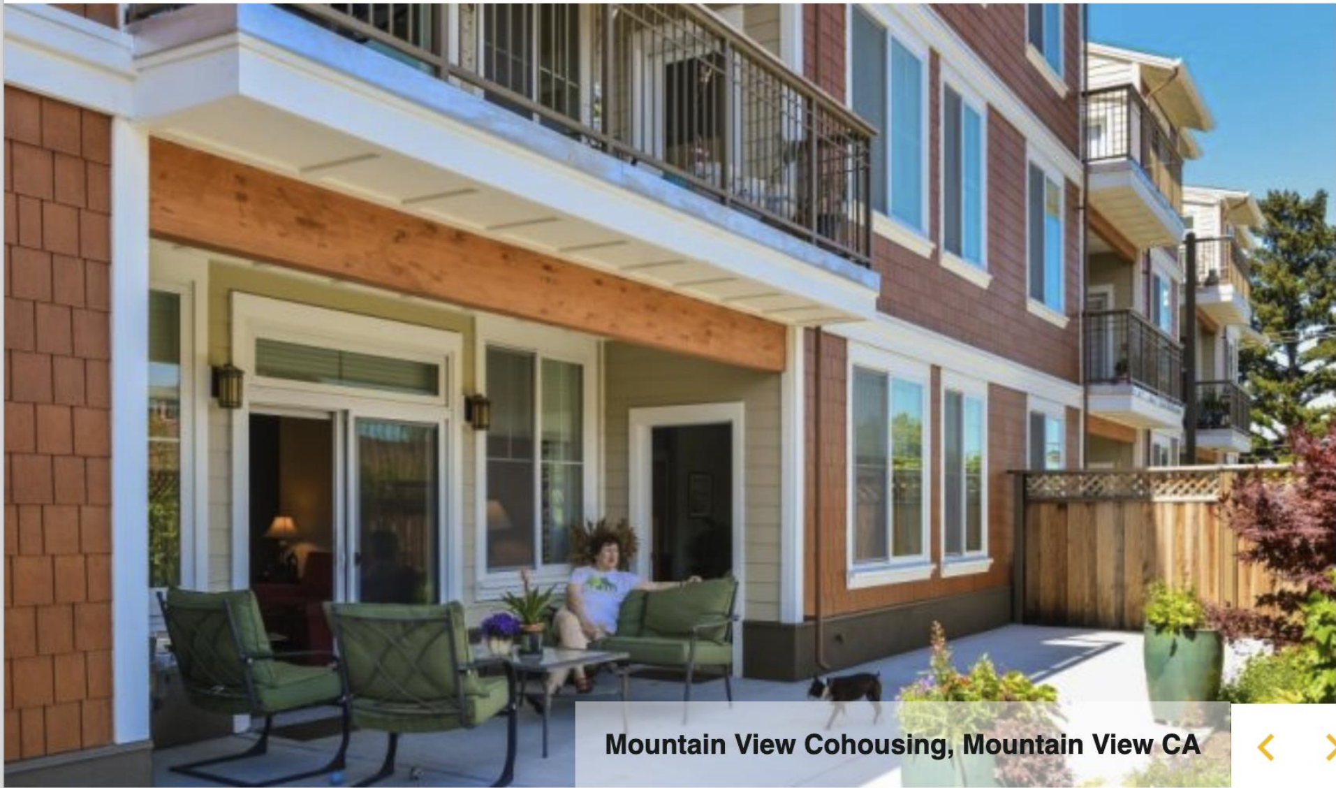
Mountain View Cohousing, Mountain View CA