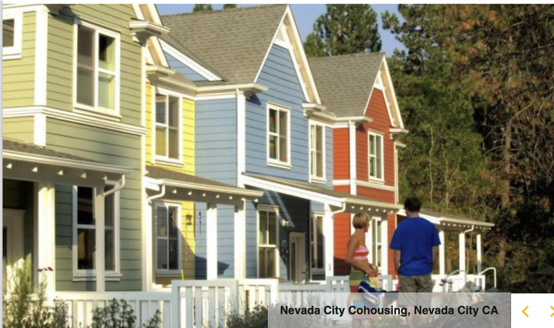
Nevada City Cohousing, Nevada City CA