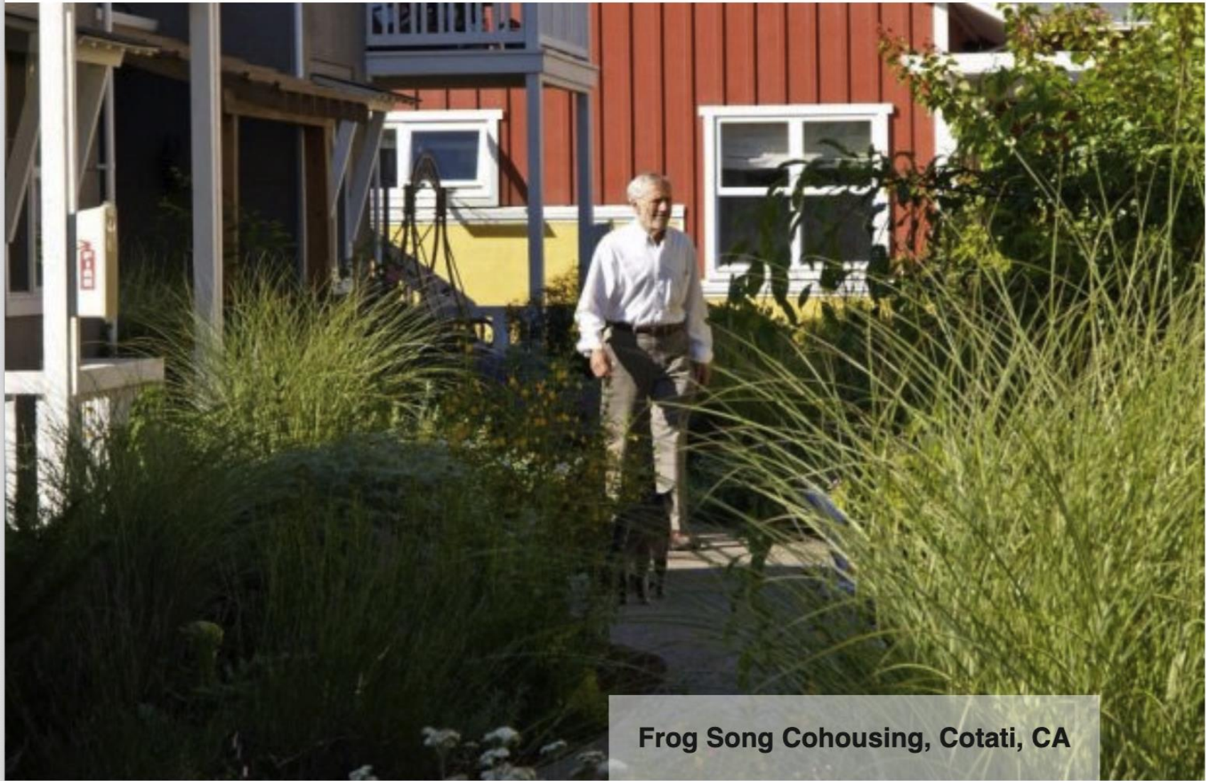
Frog Song Cohousing, Cotati, CA