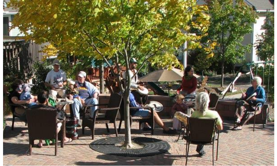
Sunward Cohousing