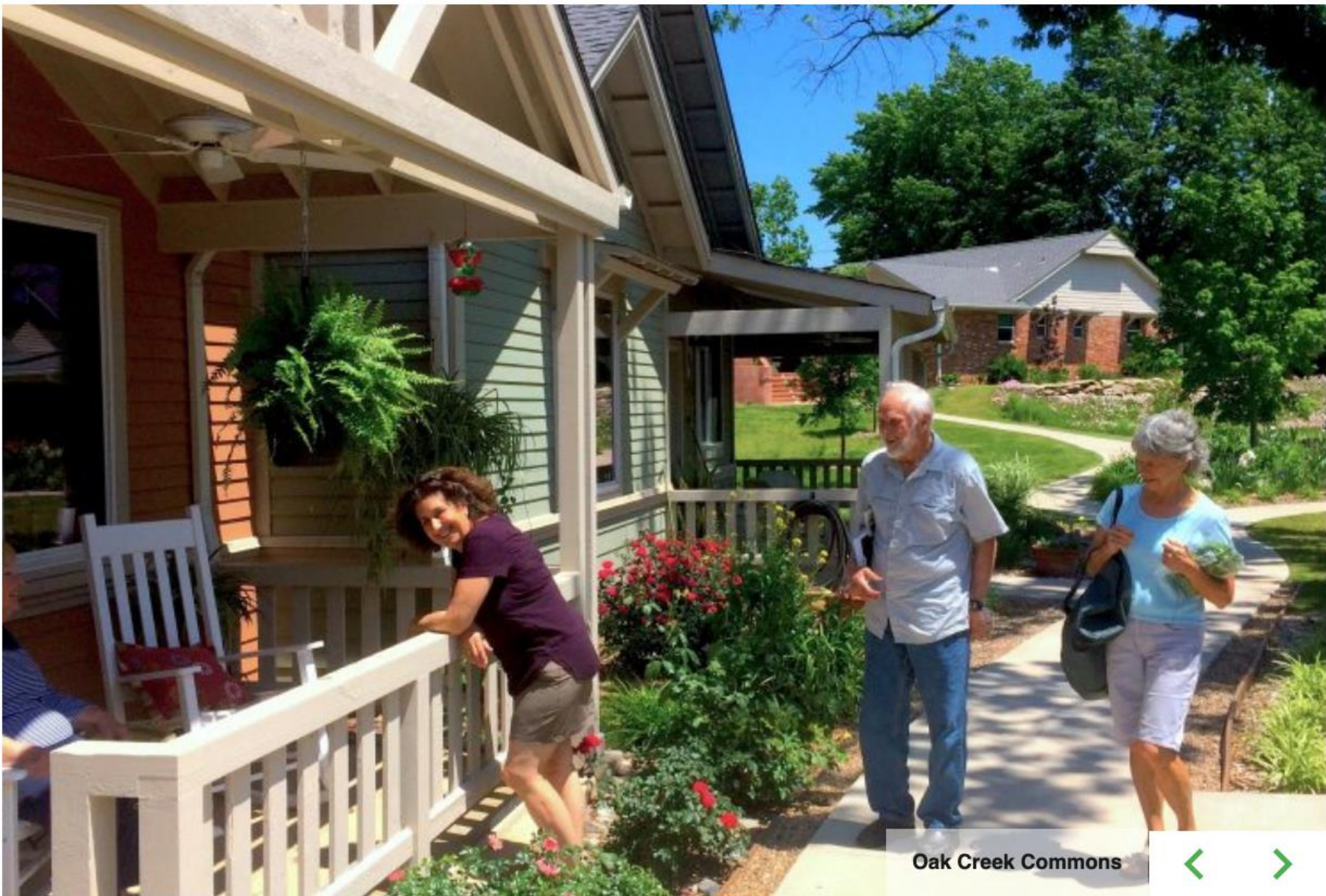
Oak Creek Commons