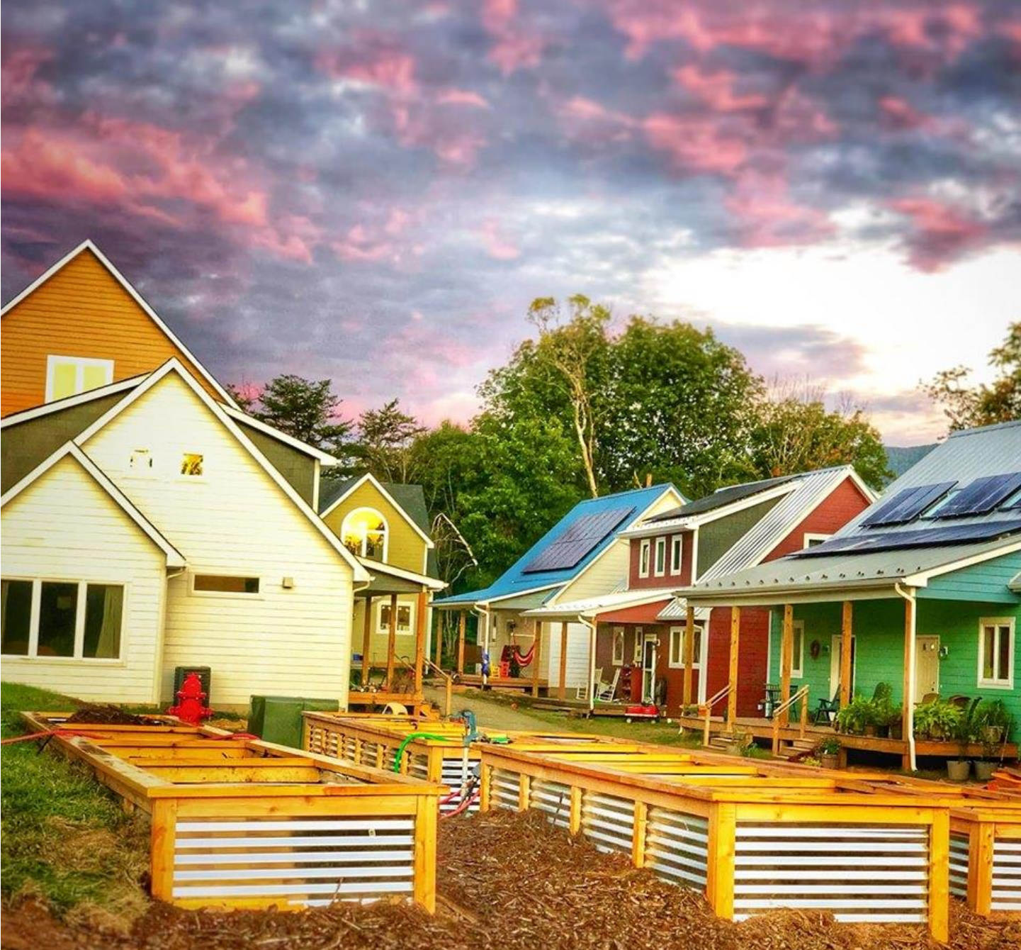
Emerson Commons, Crozet VA