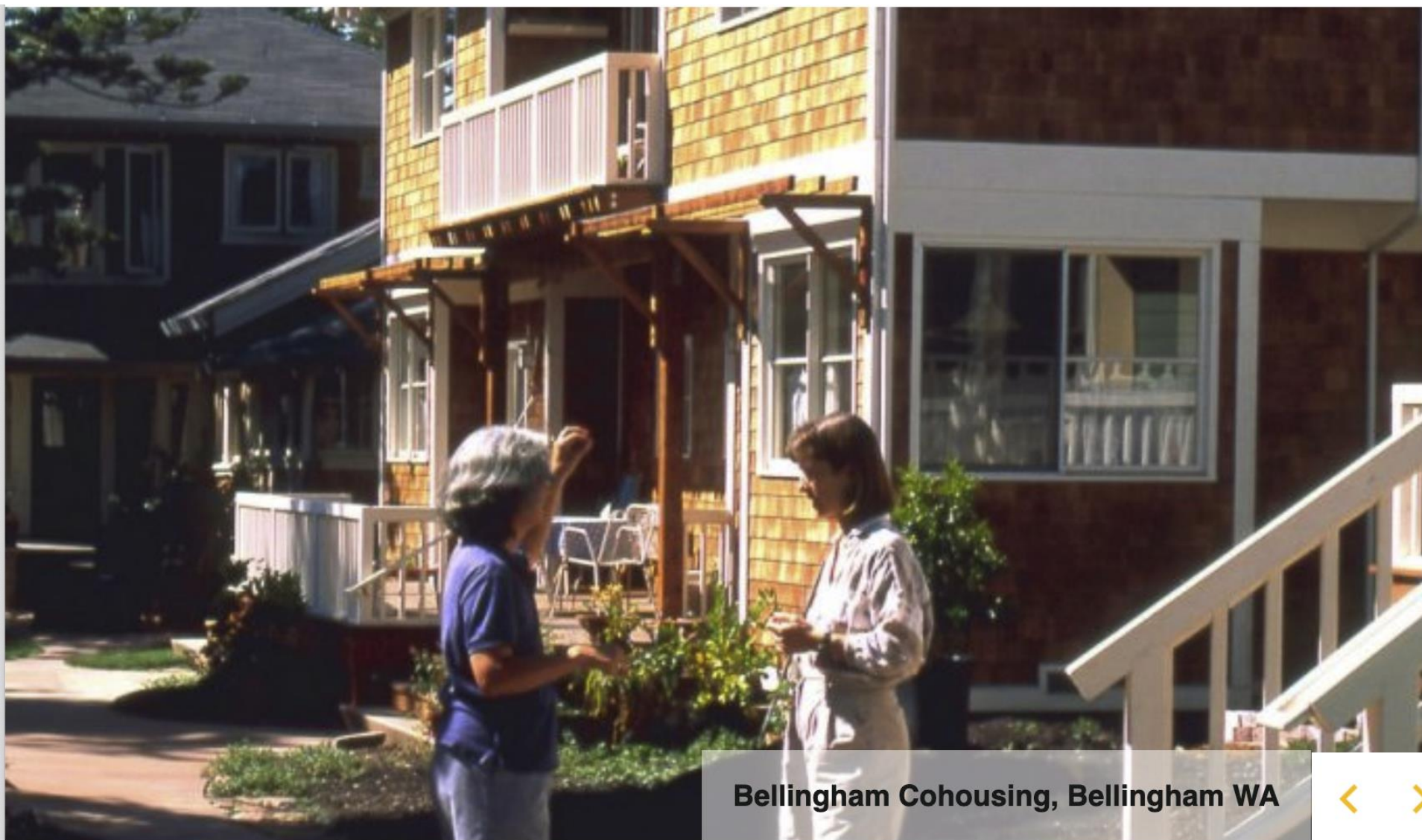
Bellingham Cohousing, Bellingham WA