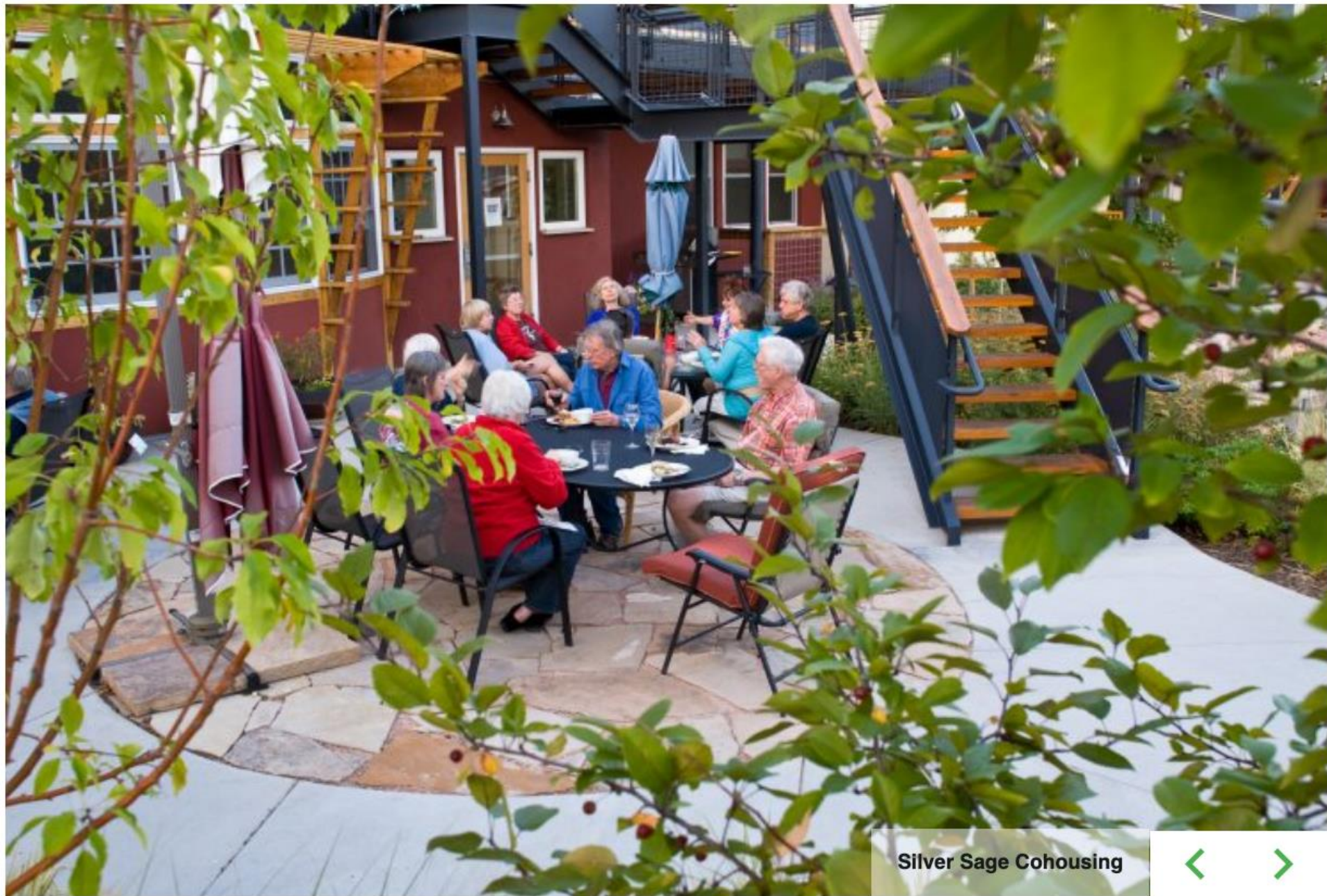
Silver Sage Cohousing