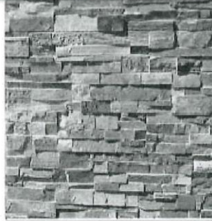
Actual surface TBD