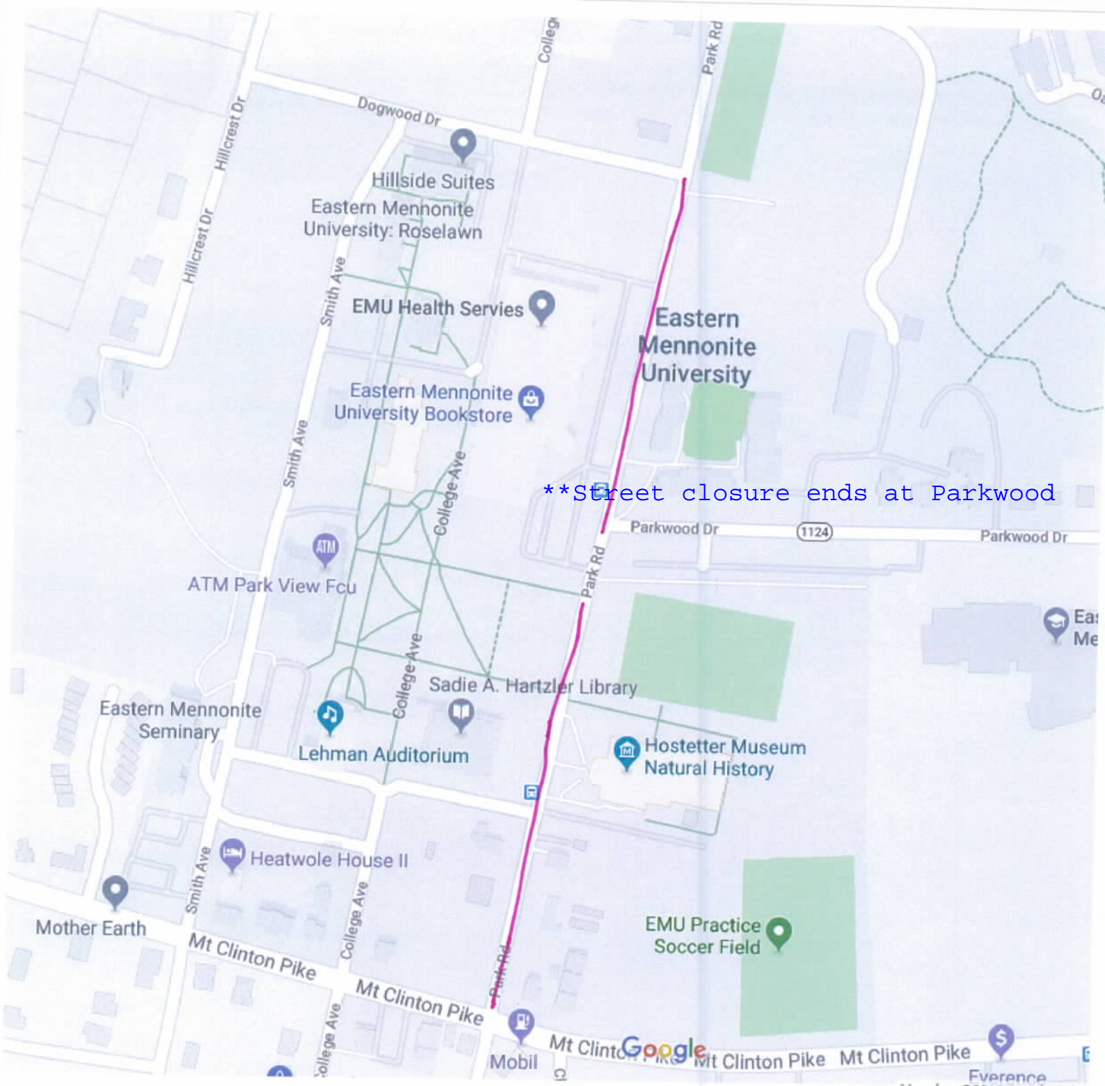
Requested Park Rd. Closure