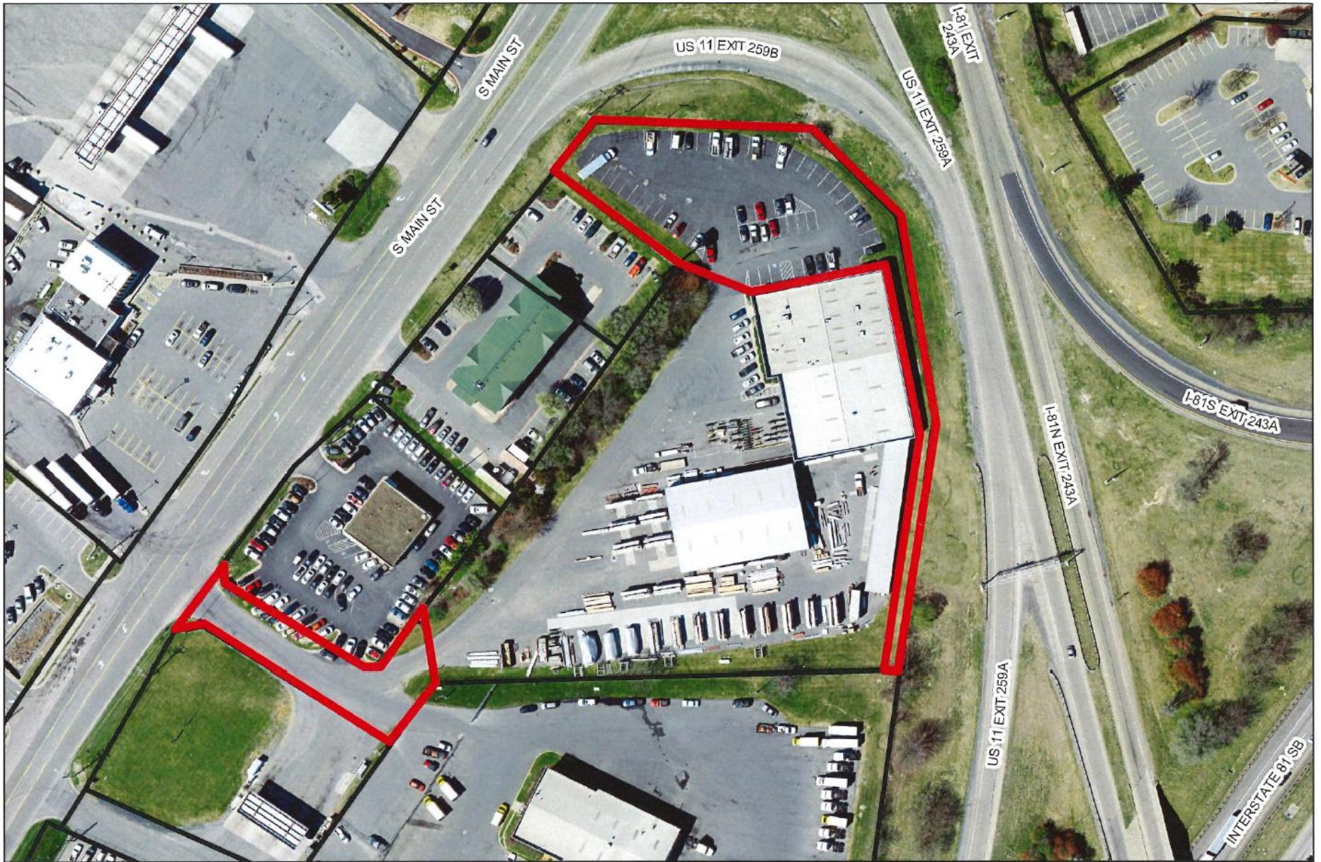
Figure 1. Special Use Permit Condition: There shall be no uncovered or unenclosed storage or display of building materials and contractors equipment in the areas illustrated. (Bounded in red.)