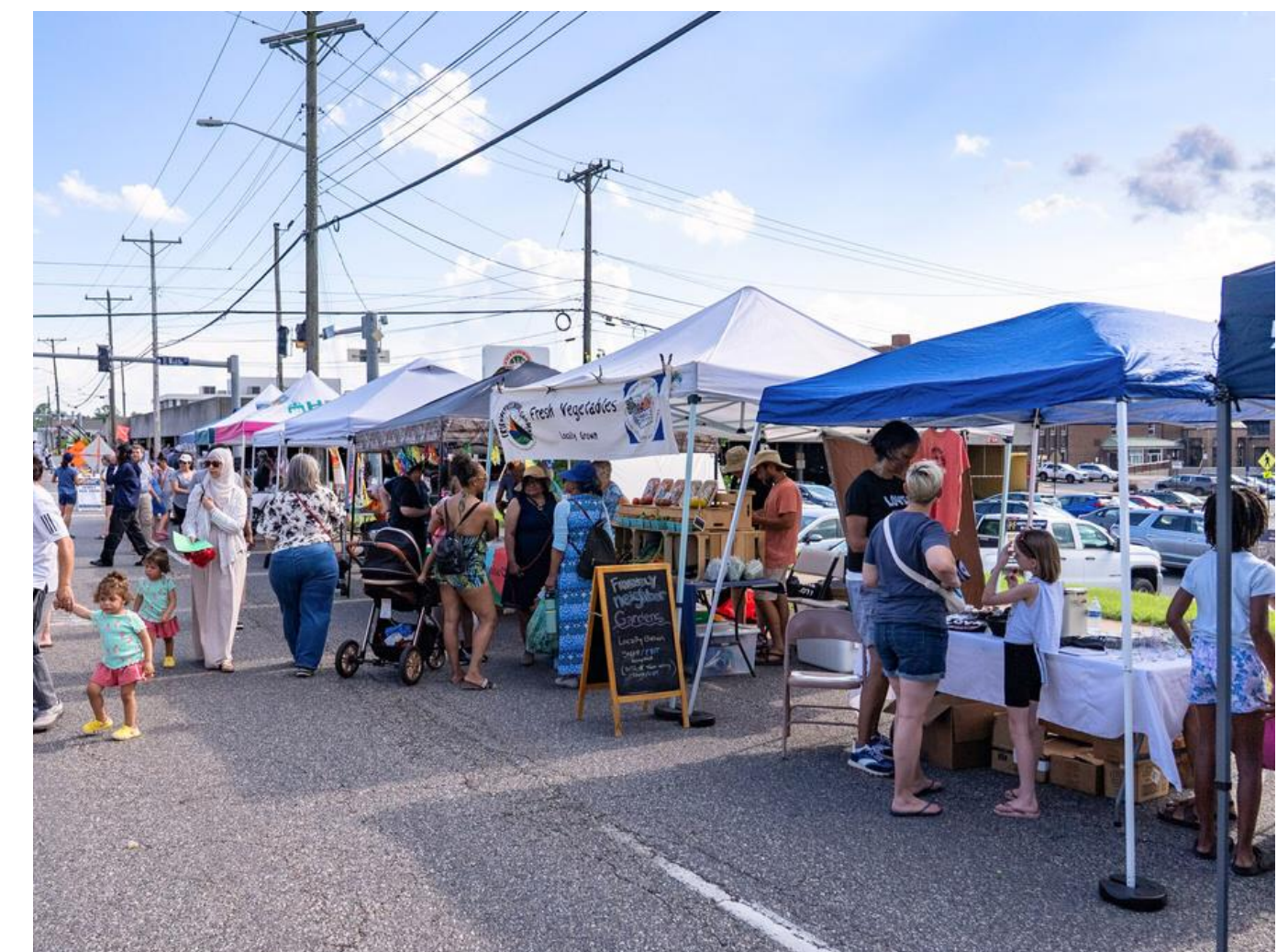
North Mason Street block party on July 12, 2025