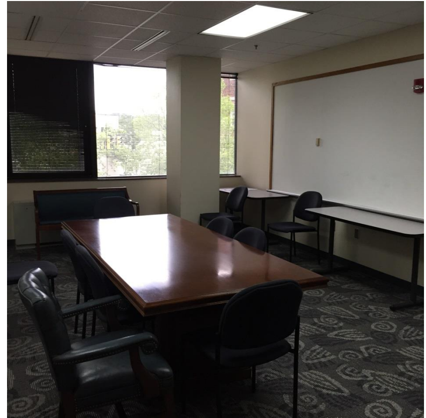
Small Conference Room