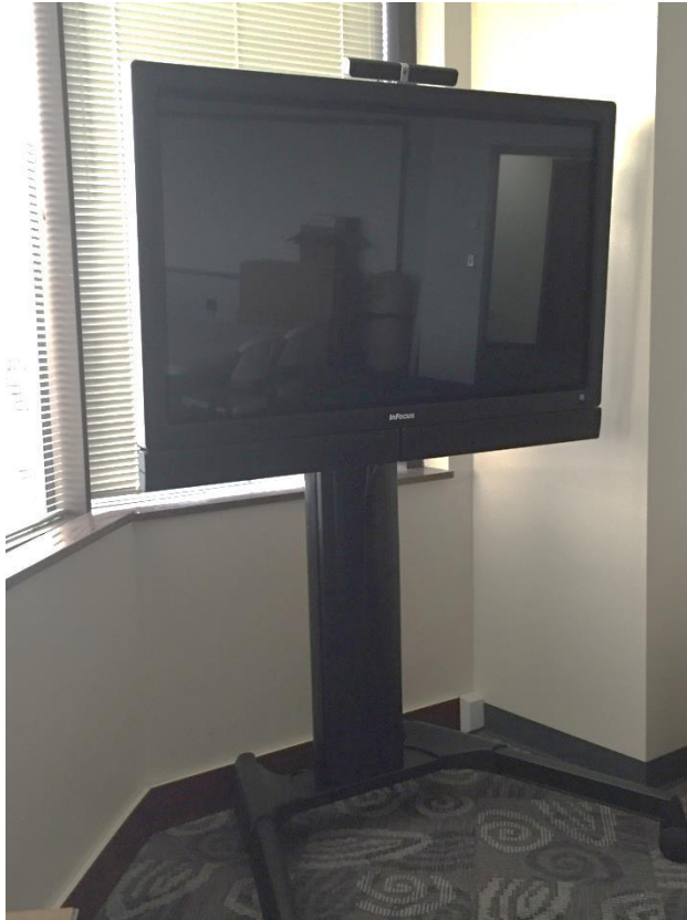
As seen with HFD Unit