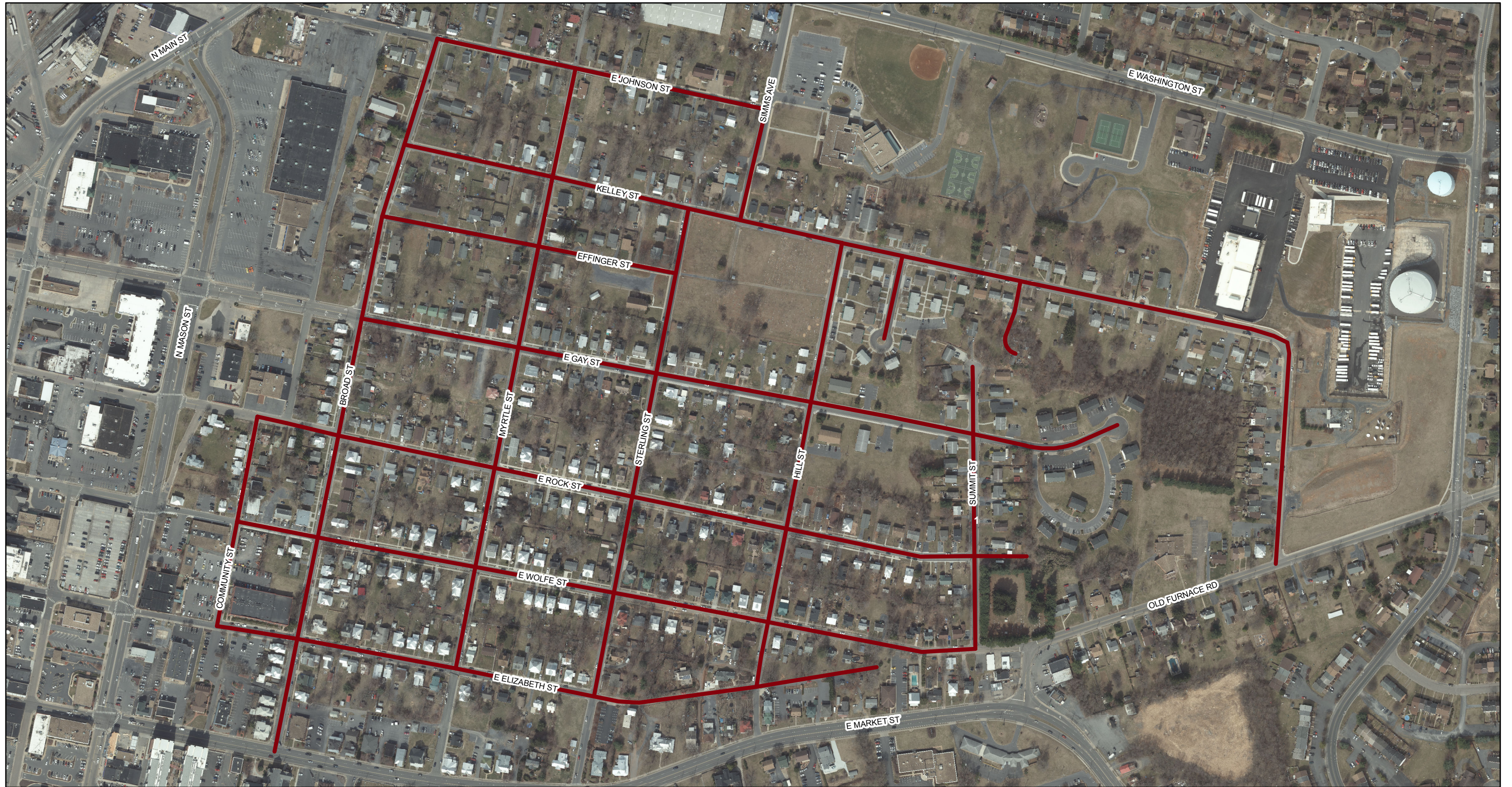
Northeast Neighborhood Neighborhood Traffic Calming Program Neighborhood Boundary 2014-2016