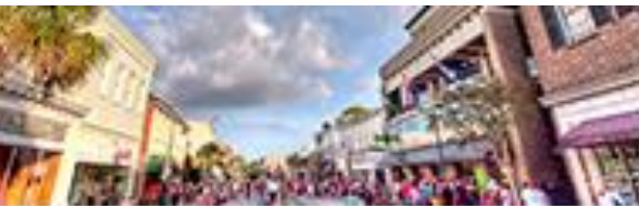
Beaufort, South Carolina