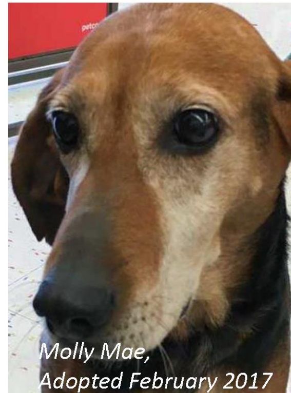
Molly Mae, Adopted February 2017