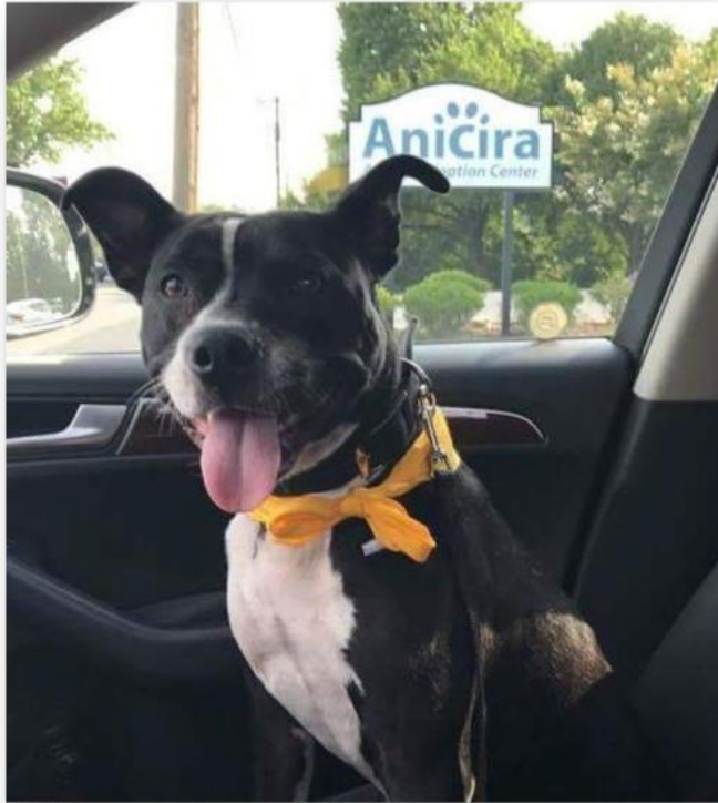
Lola, available for adoption