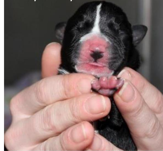
Vance, Adopted April 2017