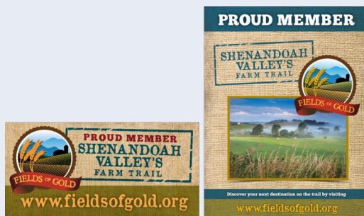
Weather-Proof Sticker and Table Stand

This signage can be used on windows, doors, counters and tables and can be taken with you to events where you have booths!