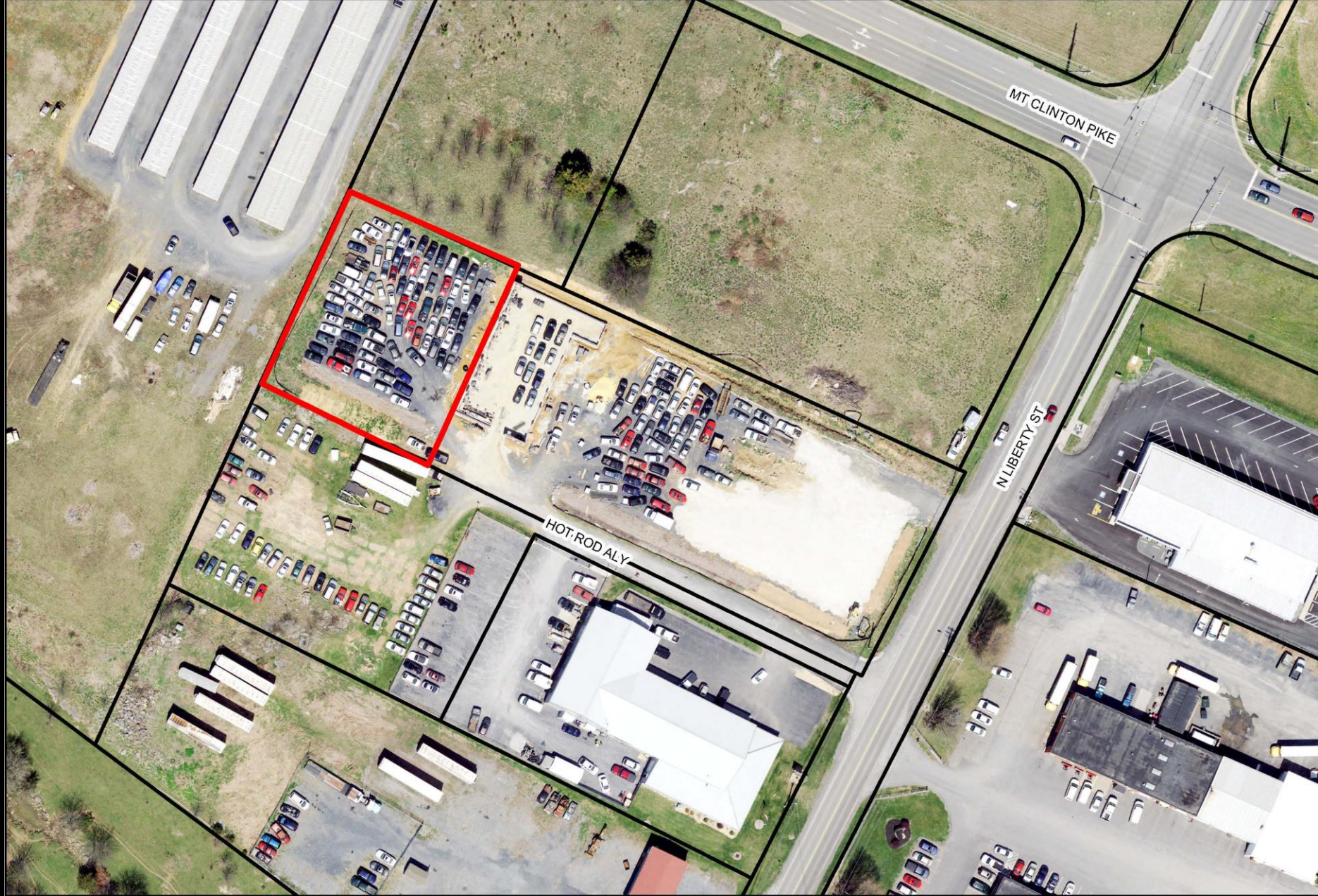
Exhibit A. Illustration of Condition #2