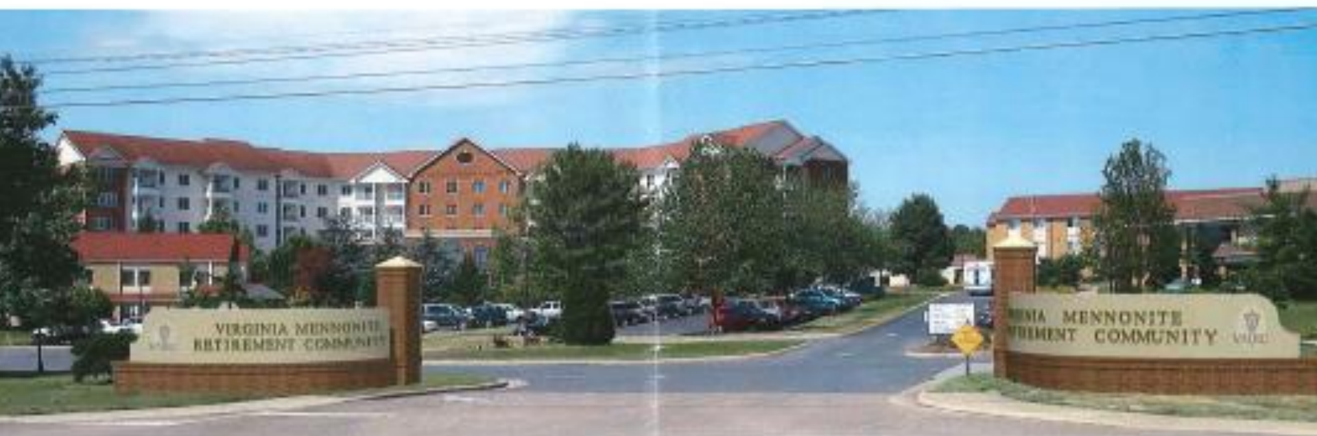
RENDERING: MAIN ENTRY SIGNS