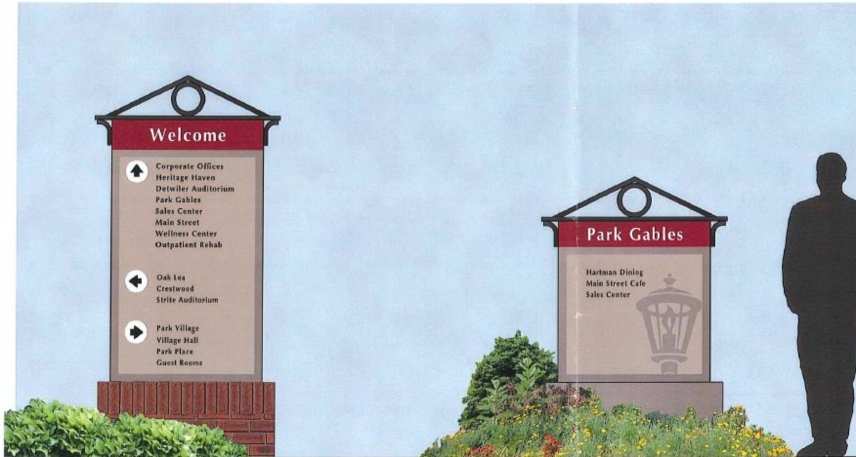
SIGN TYPE A- WAYFINDING