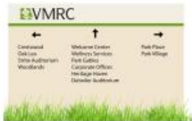
VMRC Entrance Sign Concept Image—Main Wayfinding Material: Painted Aluminum; Overall Dimensions: 3.5' x 5.5'; Text Size: 3" Height Quantity: 1